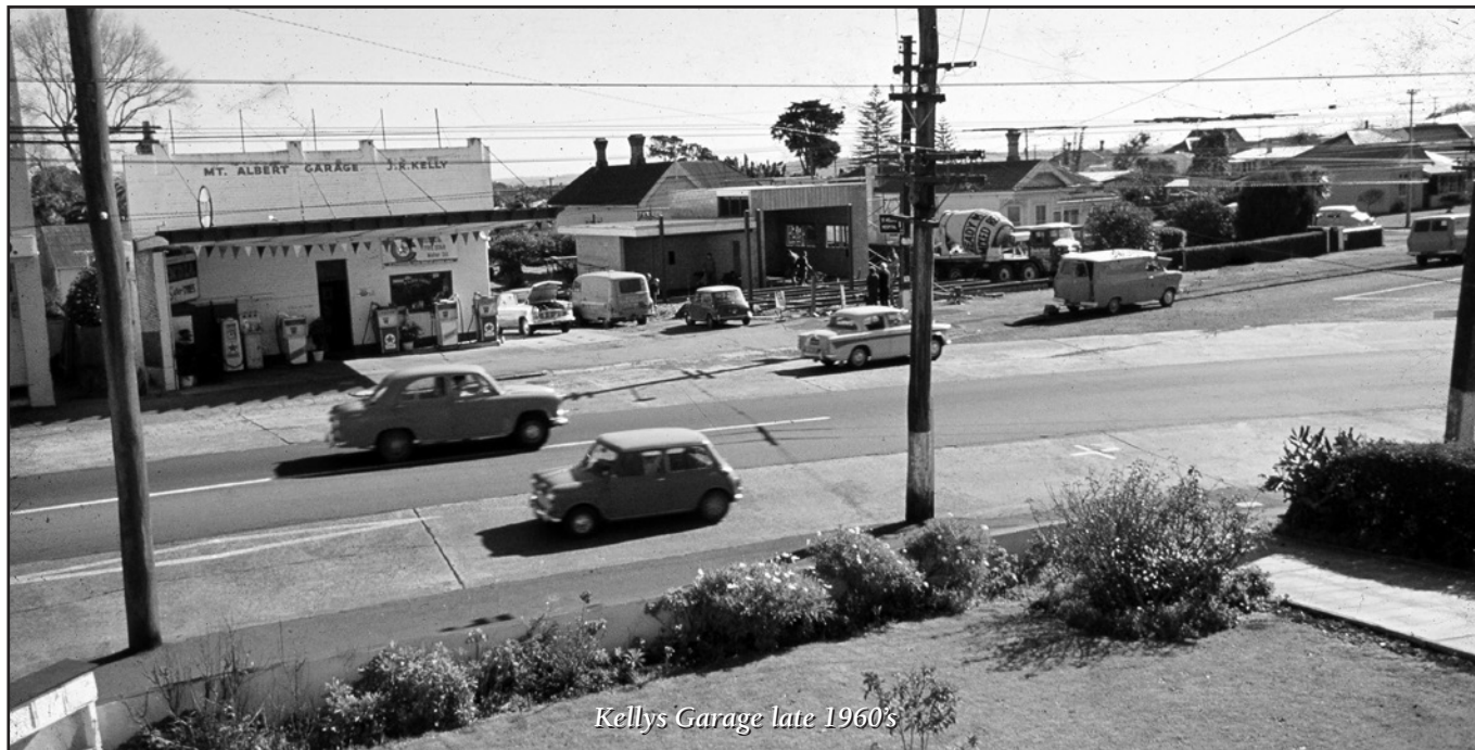
Kellys Garage late 1960's