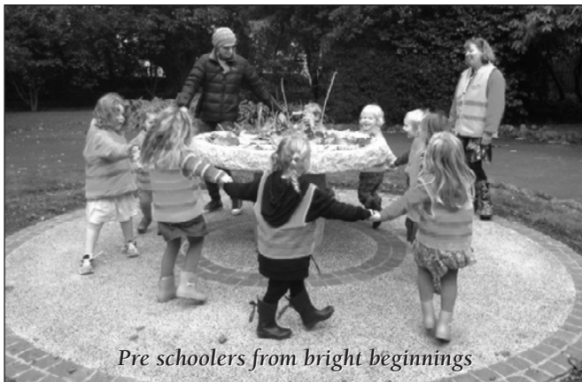
Pre schoolers from bright beginnings